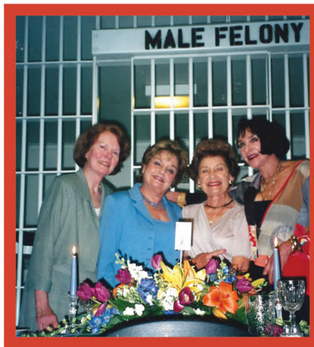
Fundraiser award recipient enjoying dinner in PVE Police Department Jail (circa 2000)

Go to www.pve75.com for a listing of 75th Anniversary activities including the Diamond Jubilee on October 18th at the Palos Verdes Golf Club. Kudos to the PVE 75th Celebration Committee for organizing exciting celebratory events throughout the 75th year for residents and families to enjoy.